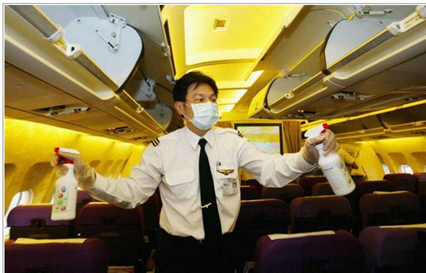
A flight attendant sprays disinfectant onboard a Thai Airlines flight to Chiang Mai from Bangkok in April 2003 — during an epidemic of the pneumonia-like SARS.

Beware of airplane water, tray tables, seat pockets, pillows and lavatories